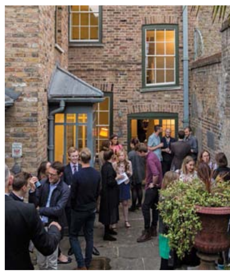
Top image: Breakfast at Castle Bungalow Bottom image: Guests celebrating the new scheme in the garden area at Princelet Street

If you don't qualify as a Young Landmarker, why not deepen your involvement with Landmark and receive priority booking opportunities by joining the Friends scheme? Find out more in the Support us section of our website.