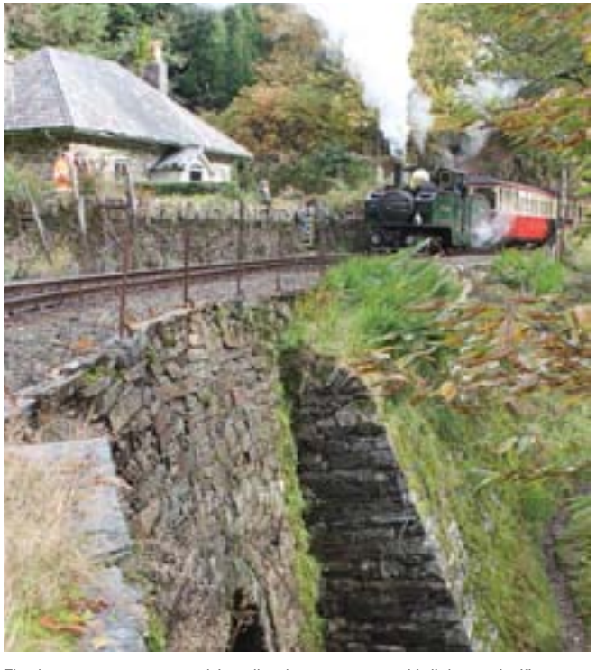
Thanks to our supporters, work is well underway to rescue this little, yet significant, cottage

Our gentle restoration will make the cottage into a Landmark for four; with sitting room, kitchen, bedroom and bathroom on the ground floor, and a further twin room upstairs. Completely new plaster ceilings are needed for the ground floor rooms, although most of the first