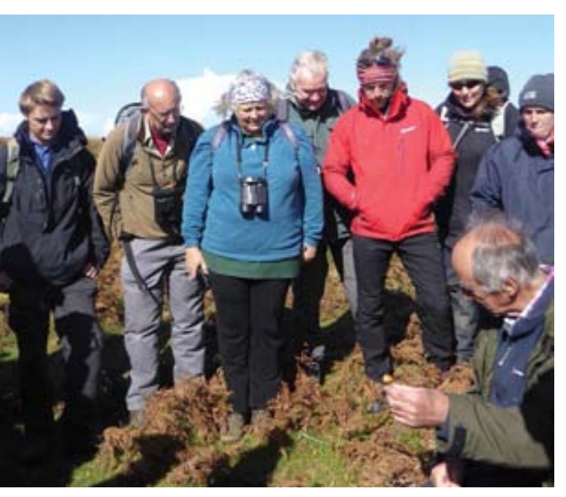
Fungi foragers during 'Discover Lundy' week

The Lundy Field Society (LFS) celebrated its 70th Anniversary with a bumper week of activities under the banner 'Discover Lundy'. Eighty of the Society's members sailed over to the island to host events that spanned moth trapping, history walks and talks, archaeology, pond dipping, bird ringing and fungi forays. St Helen's Church hosted a re-enactment of the 1926 Lundy Play 'Granite' and there was a Lundy Bake Off and gala dinner hosted in the Marisco Tavern.