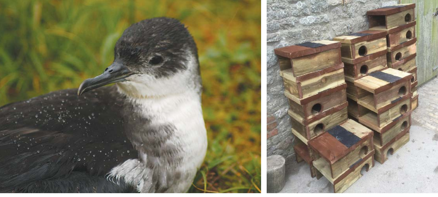
We have made and installed 30 artificial burrows for Manx shearwater seabirds (above left) on Lundy. Right: The 'Manxie Villa's' ready for installation