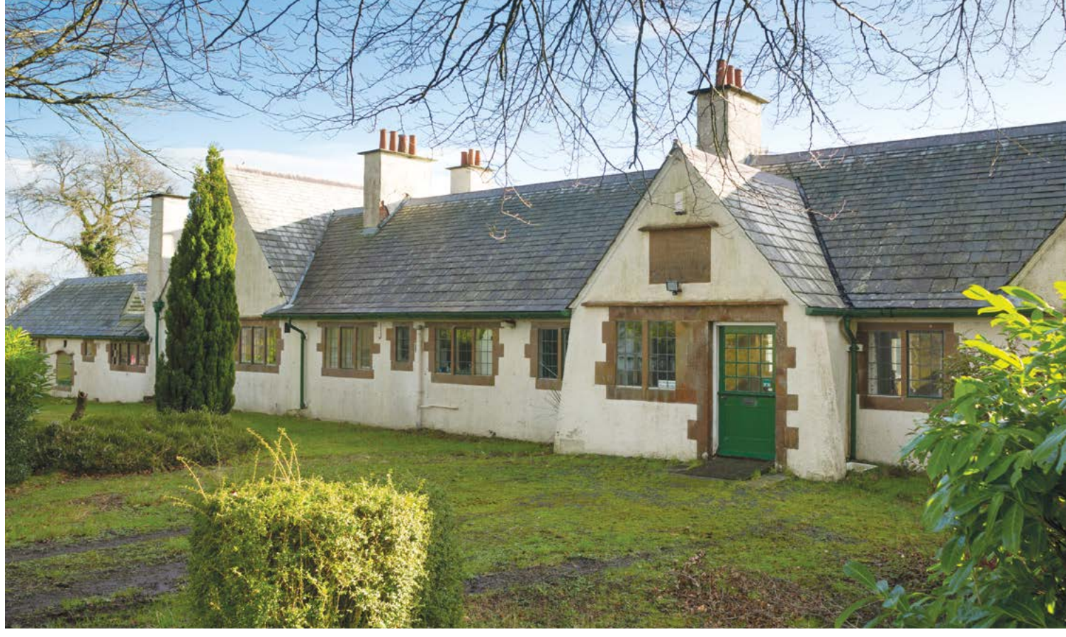
We are preparing a scheme to restore Charles Voysey's Winsford Hospital