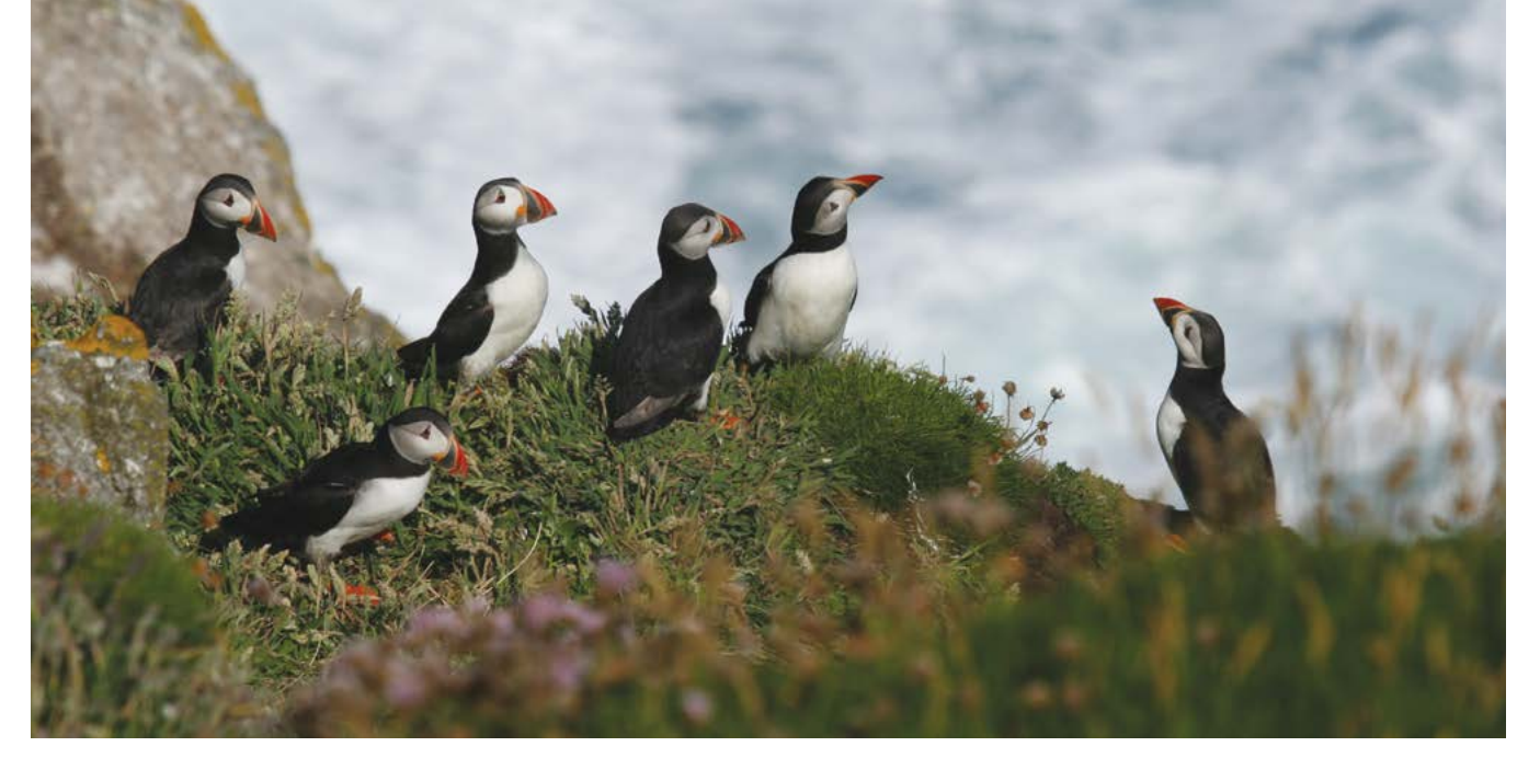
At the turn of the century the Puffin population on Lundy had fallen to fewer than 10 but this year we counted over 300 individuals