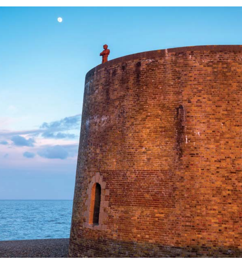
Above, from top: STAY, Lengthsman's Cottage, Warwickshire, and CHECK, Martello Tower, Suffolk.

LAND and how to visit the sites on our website. We do hope you will see them in situ and would love to hear what you think.