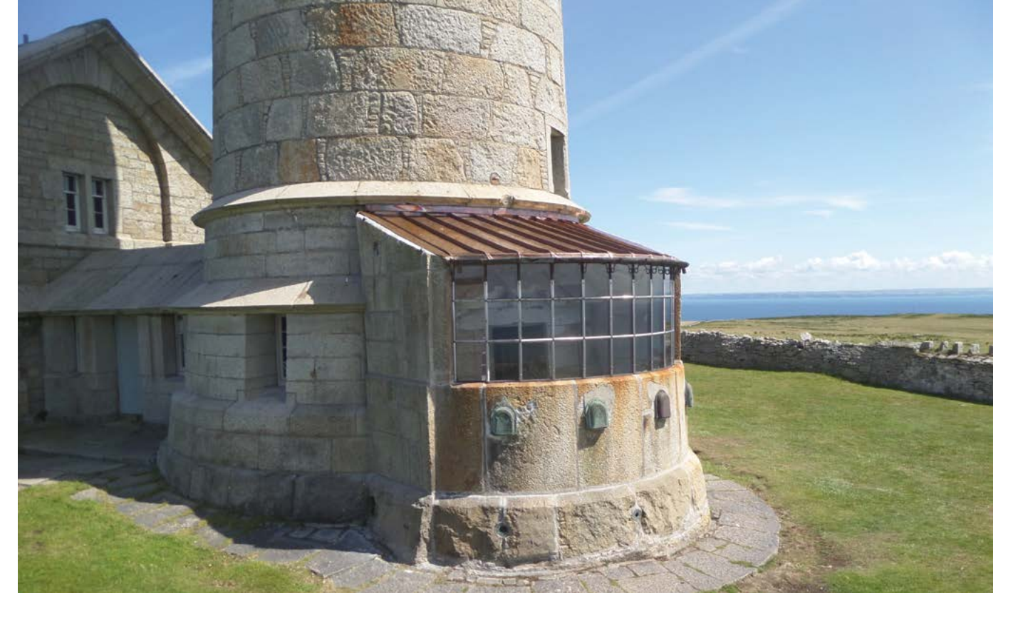
The restored lower lantern room with its beautiful cooper roof, inside it houses two curved benches so visitors can sit and take in the views across the Atlantic

Since Landmark took on the challenge of restoring Lundy in 1969, we have carried out a major restoration programme in stages restoring the keepers' quarters back to two comfortable apartments for visitors. We've also