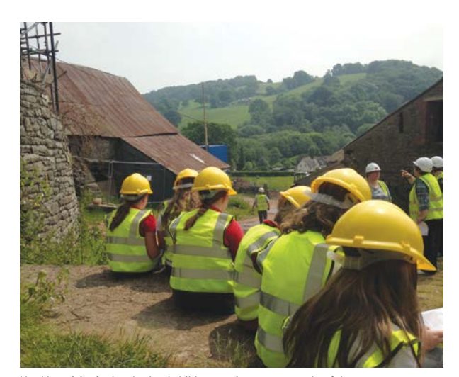
Hard hat visits for local school children are just one example of the many varied activities enabled by HLF funding for our projects, here at Llwyn Celyn, Monmouthshire.