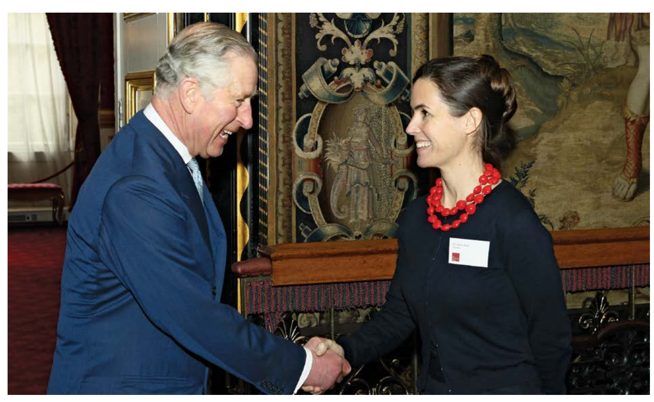
HRH The Prince of Wales accepted the invitation to become an Honorary Landmark Pioneer at St James's Palace.