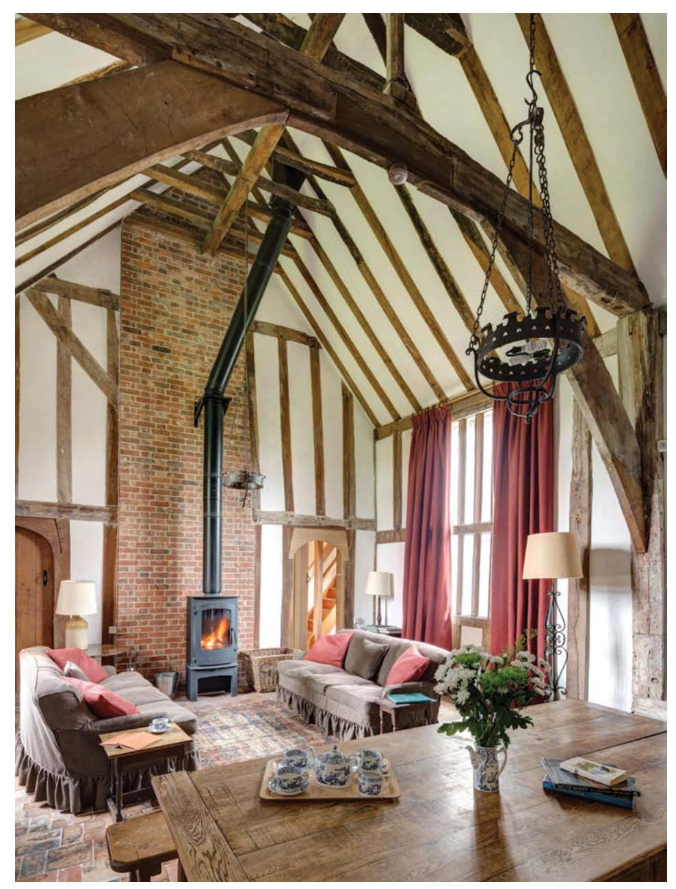
At New Inn, Suffolk, those staying experience the volume of the open hall of a 15th-century tavern.