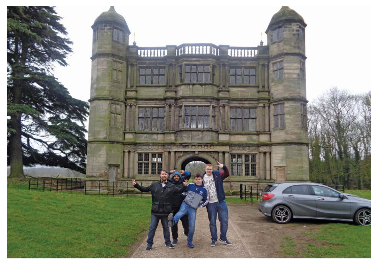
The charity New Roots, which supports homeless people in the West Midlands, enjoyed a 50 For Free break at Tixall Gatehouse, Staffordshire.