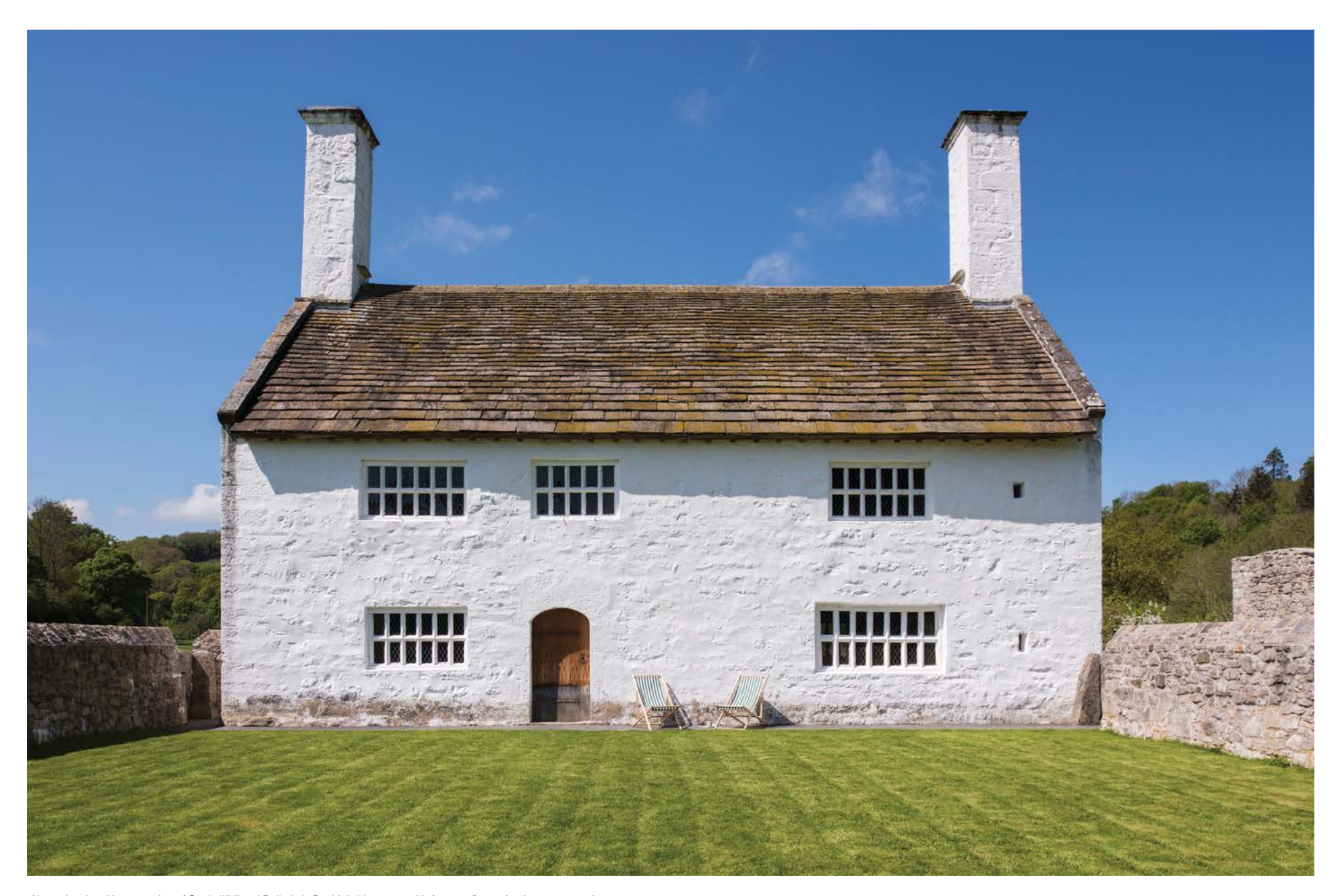
Above: Landmark's restoration of Grade II* listed Dolbelydr, Denbighshire, rescued it from roofless ruination, see opposite.