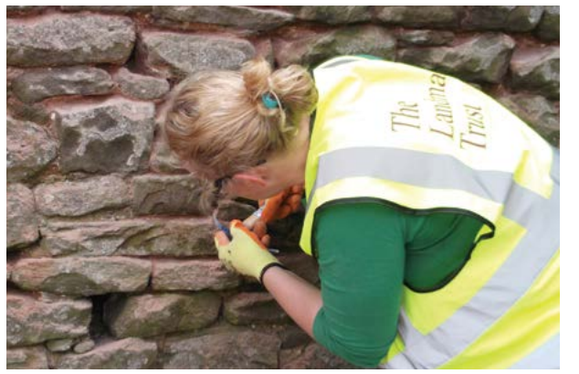
Ensuring the survival of traditional craft skills lies at the heart of our work. Top: Dolbelydr, Denbighshire, before restoration and today as a Landmark, opposite. Bottom left: Carved doorhead at New Inn, Suffolk. Bottom right: Wall repairs at Llwyn Celyn, Monmouthshire.