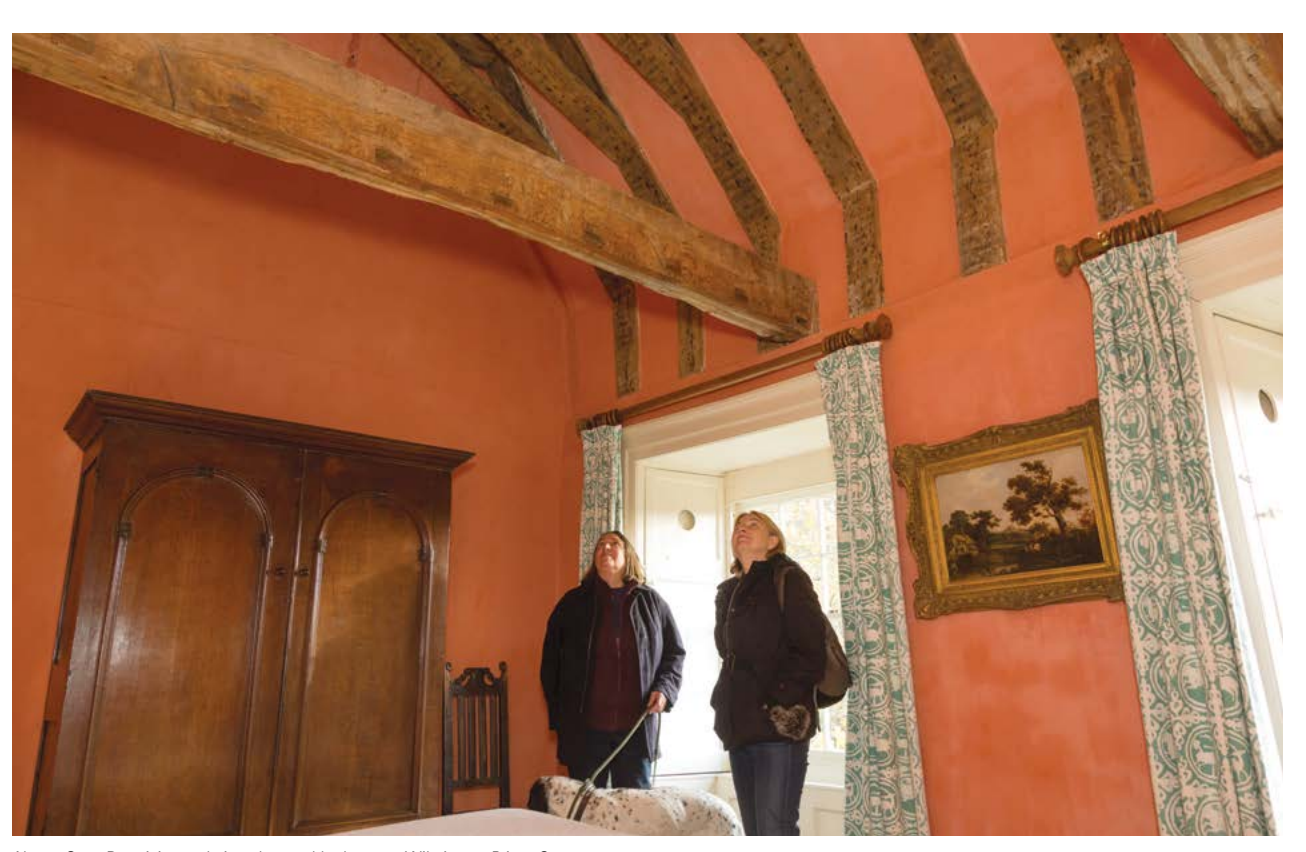
Above: Open Day visitors admire a beamed-bedroom at Wilmington Priory, Sussex.