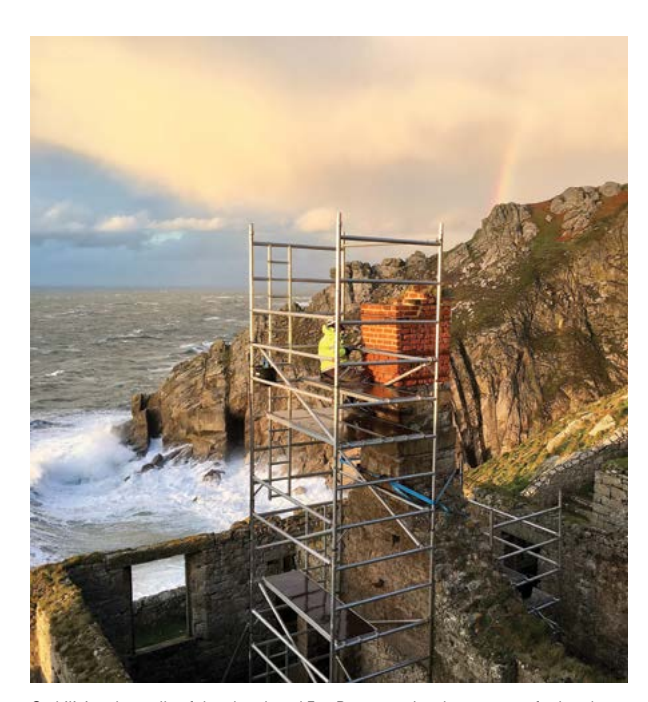
Stabilising the walls of the abandoned Fog Battery on Lundy to prevent further decay.

Caring for Lundy's buildings has never been straightforward and 2016 was no different. Heavily exposed to the full force of the Atlantic, our team tackled re-pointing the crumbling walls of the remote Fog Battery to ensure its survival. The island had a busy year, with some 17,034 visitors arriving by air and sea. 2016 also brought the 70th Anniversary of the Lundy Field Society, which researches and records all aspects of Lundy's extraordinary ecology. Lundy's seabirds had a bumper year. Since rats were removed from the island, the Puffin population has climbed to over 300 from just five in 2004 and Manx Shearwater numbers have increased tenfold to 3,500.