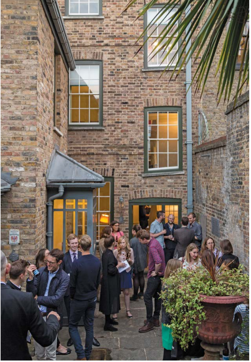
Top left: Our Llwyn Celyn project welcomed the Hay, Brecon and Talgarth Sanctuary for Refugees with a group of 40 men, women and children living in Swansea. Bottom: A gentleman from the Plymouth Guild at Silverton Park Stables, Devon, during the 50 For Free week for charities. Right: Young Landmarkers at Princelet Street, London, celebrate the launch of the new membership scheme aimed at people in their twenties.