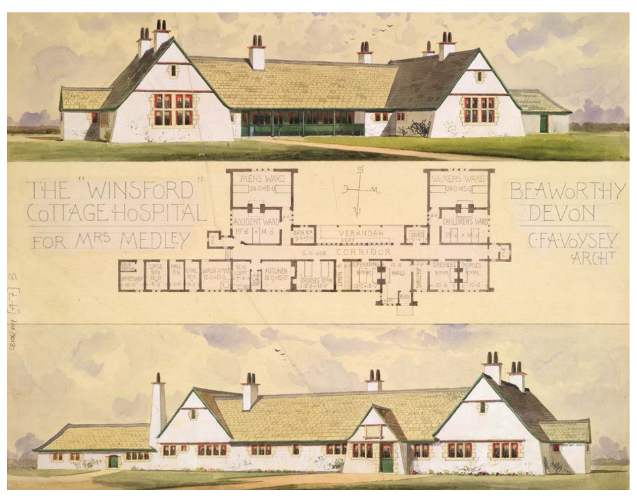
Winsford Cottage Hospital represents the revolutionary change brought to the lives of ordinary people by the advent of the cottage hospital.