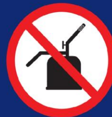
Ignitable gas devices